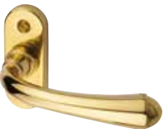
T88 MR 007 - LR