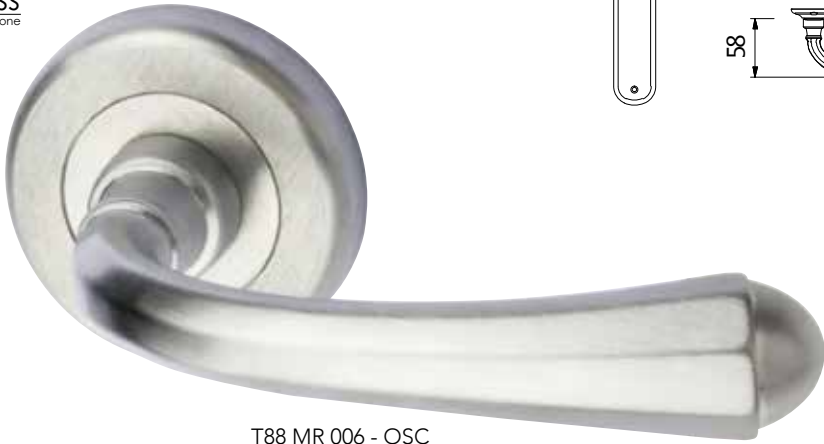
T88 MR 006 - OSC