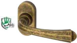
T88 MR 009 - AN