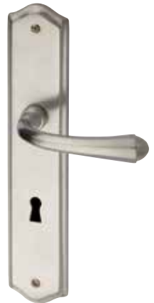
T88 MP 039 - OSC