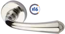
T88 MR 416 - OC