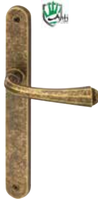
T88 MP 026 - AN