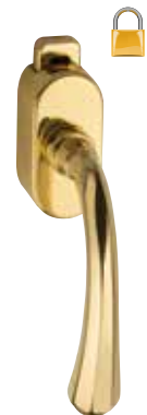
T88 DK 075 - LV