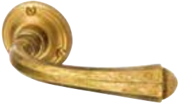
T88 MR T36 - VBN