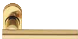
184 MR 009 OS/LV