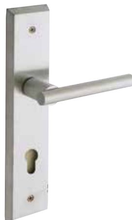
184 MP 130 OSC

Per caratteristiche tecniche rosette vedi apposito capitolo soluzioni tecniche e componenti / For technical specifications rosettes see specific section technical solutions and components