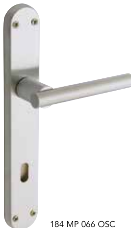
184 MP 066 OSC

Vedi capitolo "Porte d'entrata" See chapter "Entrance doors"