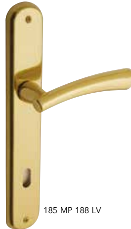
185 MP 188 LV