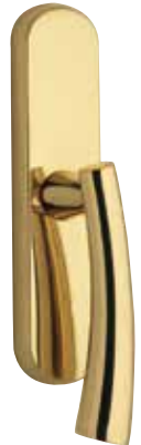
185 SE 070 LV 185 SG 070 LV