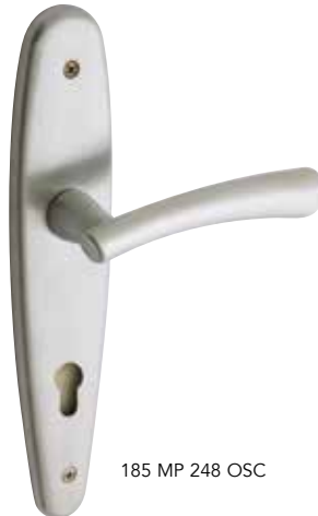
185 MP 248 OSC