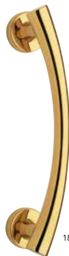
185 MS 002 PVD

Vedi capitolo "Porte d'entrata" See chapter "Entrance doors"