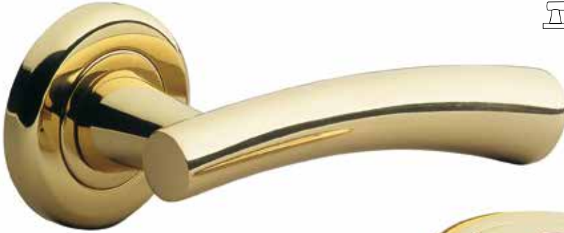
185 MR 006 LV