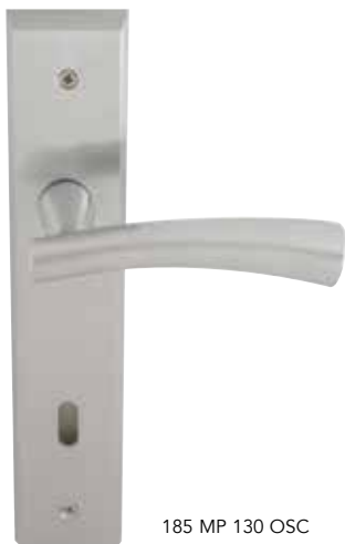
185 MP 130 OSC