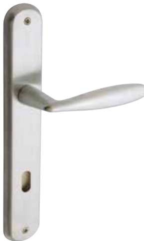
171 MP 188 ZSC