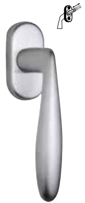
171 DK 024 ZSC