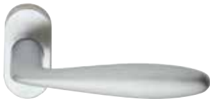
171 MR 009 ZSC