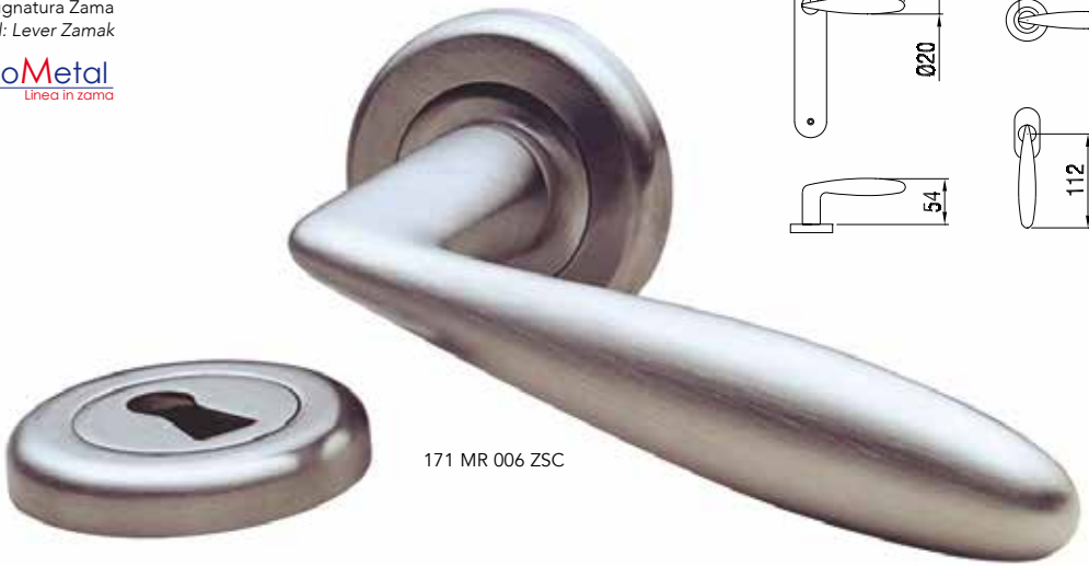
171 MR 006 ZSC