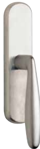
171 SE 070 ZSC 171 SG 070 ZSC