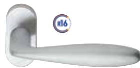
171 MR 916 ZSC

Per caratteristiche tecniche rosette vedi apposito capitolo soluzioni tecniche e componenti / For technical specifications rosettes see specific section technical solutions and components