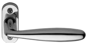
171 MR 007 ZCR