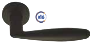
171 MR 416 NR