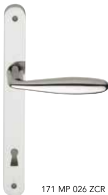
171 MP 026 ZCR