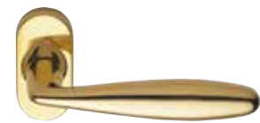
171 MR 009 PVD

* Placca adatta a movimenti intercambiabili Plate suitable to interchangeable movements